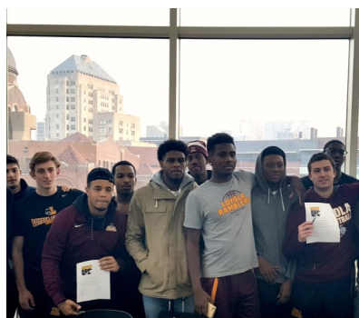
Below: The Men's Basketball team sign the pledge

Loyola participated in It's On Us week, a national campaign to stop sexual violence on college campuses. We tabled in Damen where over 50 students pledged to step in and stop sexual violence! University Athletics also got involved, encouraging athletic teams to sign as well!