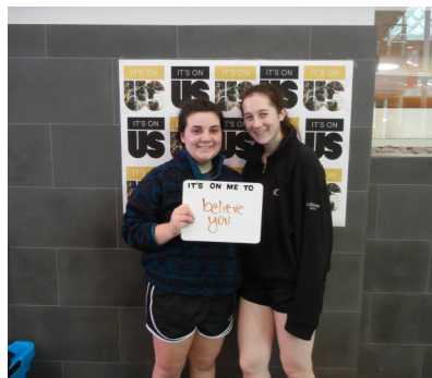
Above: Students pledge to believe survivors