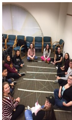
CHANGE makers completing 8 hours of training

semester recruiting members and drafting a constitution. On January