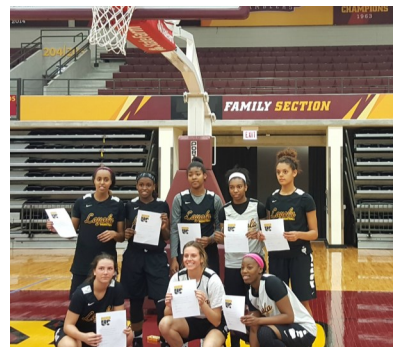
Above: The Women's Basketball team pledge to stop sexual violence

Loyola participated in It's On Us week, a national campaign to stop sexual violence on college campuses. We tabled in Damen where over 50 students pledged to step in and stop sexual violence! University Athletics also got involved, encouraging athletic teams to sign as well!